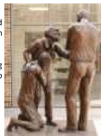
The statue 'The Reconciler' in the courtyard of the centre.

Smaller Dialogue Groups will also be planned for more personal and in-depth discussion and sharing of ideas and experience. All groups will produce valuable documents and resources that will be uploaded on the Congress website as well as WEAPRI.