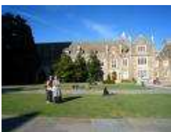
Duke Divinity School and Centre for Peace and Reconciliation.

With still nearly 14 months till Congress the design and structure of the collaboration between Lausanne and WEAPRI is still being developed and designed.